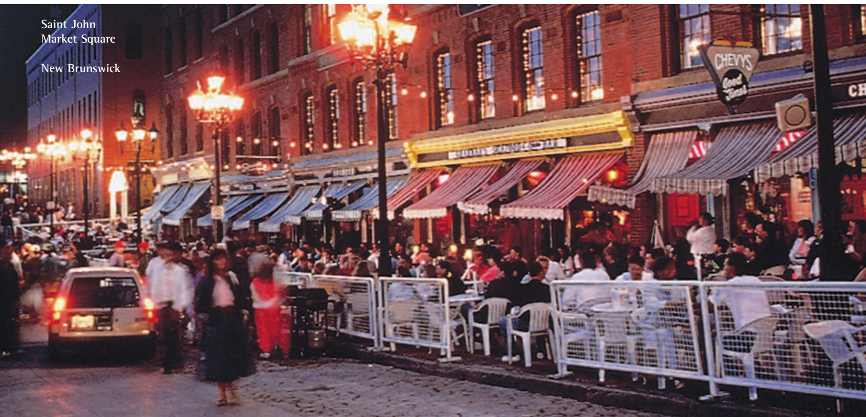
Saint John Market Square New Brunswick

At the Atlantic Canada Opportunities Agency (ACOA), we believe that a healthy environment is essential to the development of a strong, growing and sustainable economy. We are committed to protecting the environment of this region by promoting sustainable businesses and communities in Atlantic Canada and by setting an example in the environmental management of ACOA's own operations.