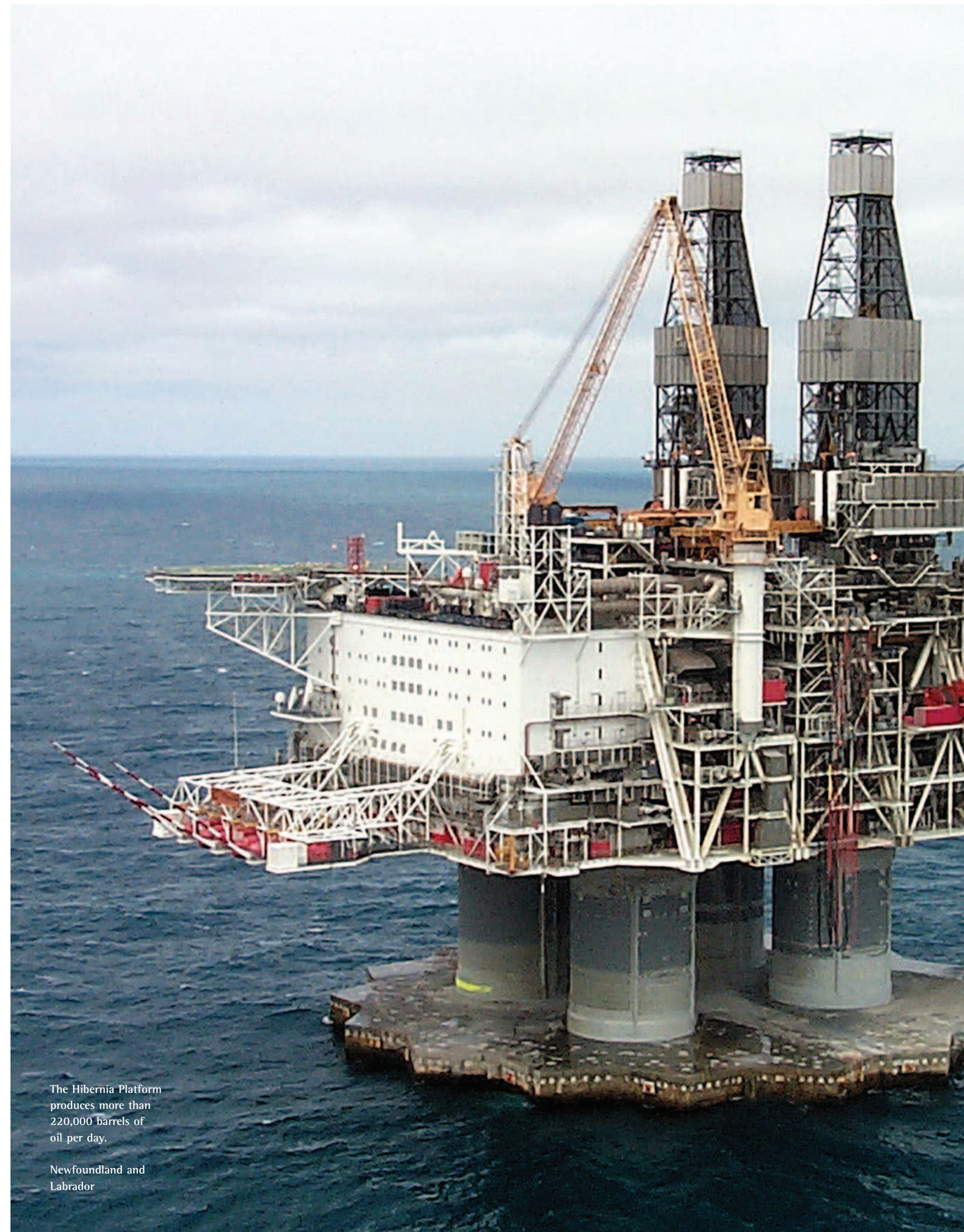
The Hibernia Platform produces more than 220,000 barrels of oil per day.